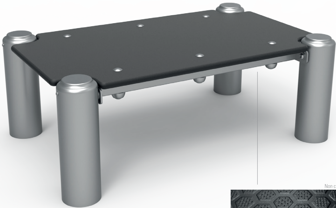
Non contractual picture